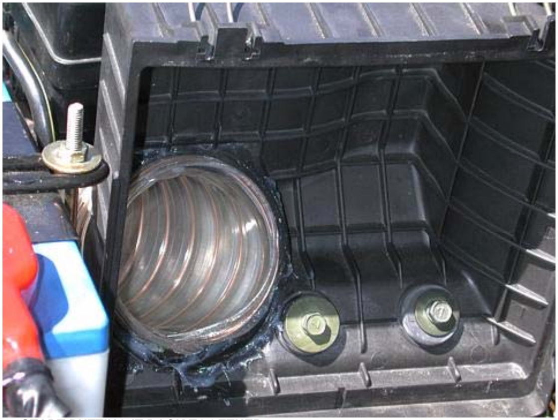
9. START PUTTING IT BACK TOGETHER Trimming the ends may require Selastic to help make it tidy.