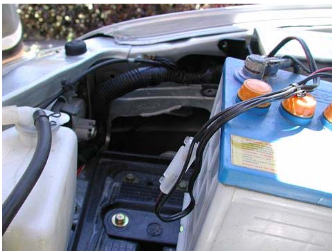
3. THE HOLE TO AIM FOR Access to behind the bumper from the engine bay.

2. THE WEIRD MAS THINGY The Weird MAS thingy (try squinting...trippy huh).