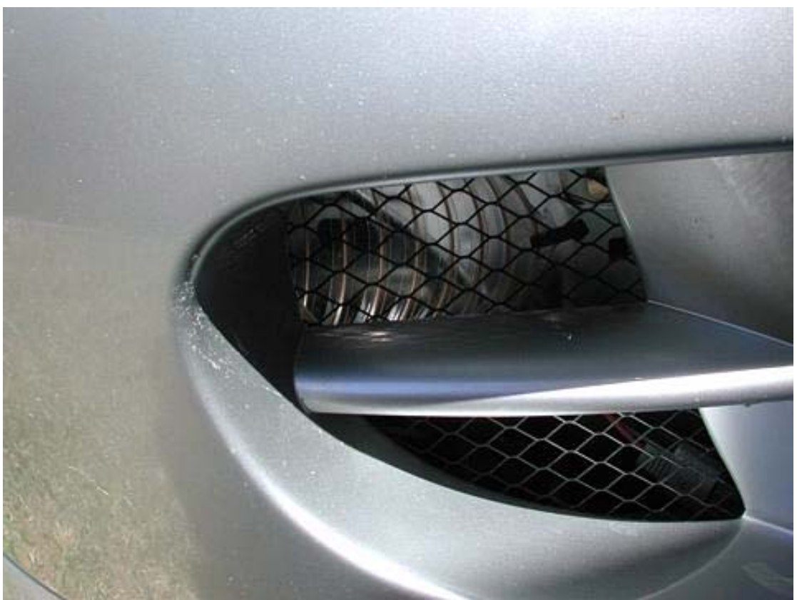
7. THANK GOD FOR CABLE TIES As per Andrew's hints, The Mighty Cable ties saves the day!

6. BEHIND THE VENT IN THE BUMPER Pull the hosing around the guard & it should come out here.