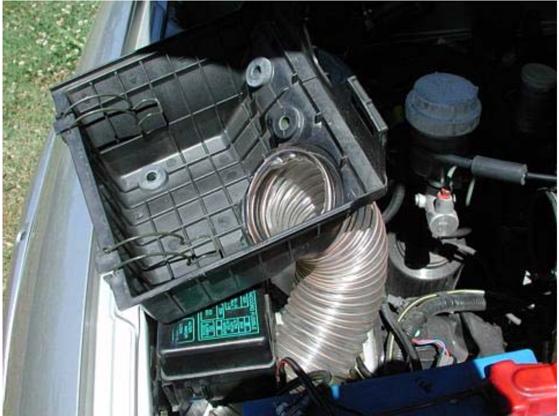
8. CUT YOUR LENGTH FEED IN AIRBOX Cut to length. Feed into the airbox, pull it tight and trim.