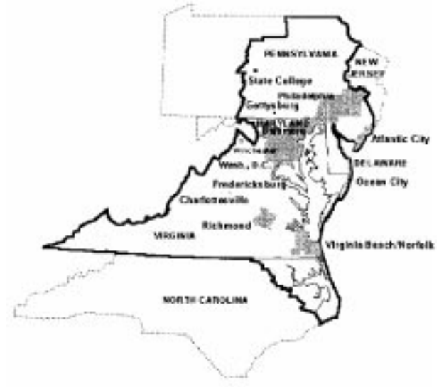
A route guidance availability

1999 by NavTech Route guidance available areas Route guidance available for main roads only