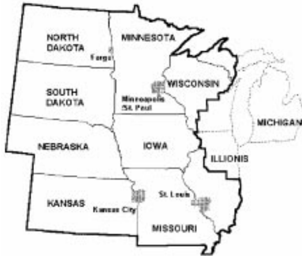
A route guidance availability

1999 by NavTech Route guidance available areas Route guidance available for main roads only