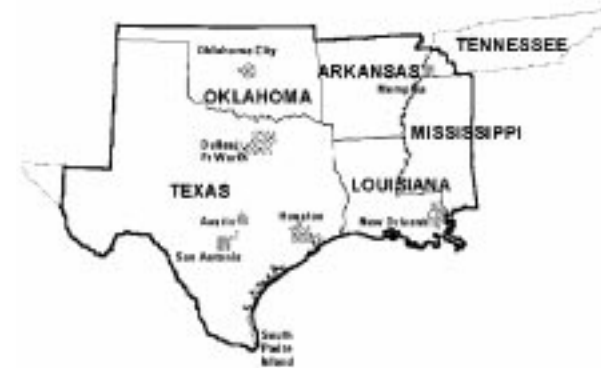
A route guidance availability

1999 by NavTech Route guidance available areas Route guidance available for main roads only