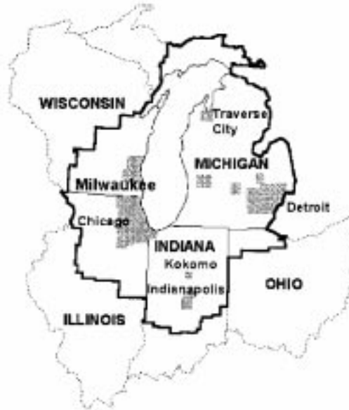
A route guidance availability

1999 by NavTech Route guidance available areas Route guidance available for main roads only