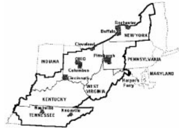
A route guidance availability

1999 by NavTech Route guidance available areas Route guidance available for main roads only