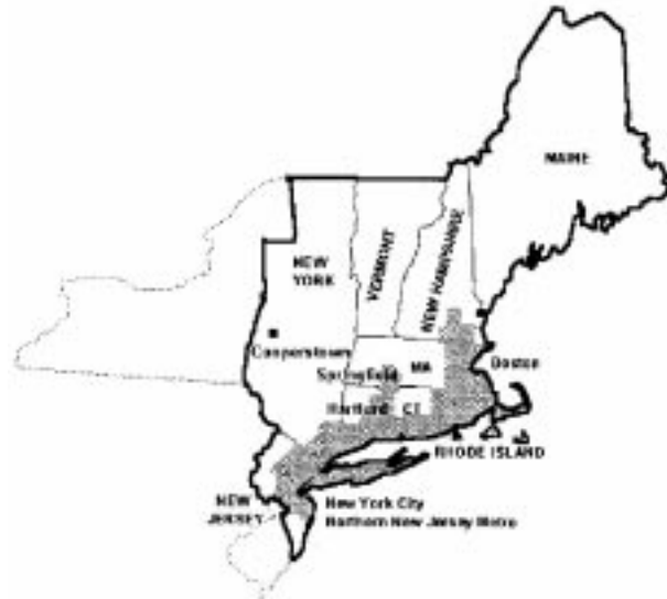
A route guidance availability

1999 by NavTech Route guidance available areas Route guidance available for main roads only