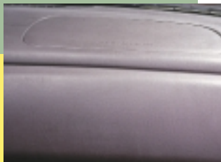
Passenger Airbag Module