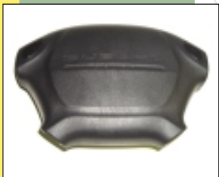
Proper Module Handling