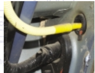
SRS Wiring Harness