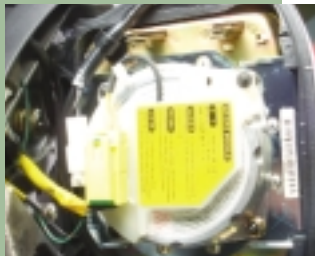
Driver Airbag Module