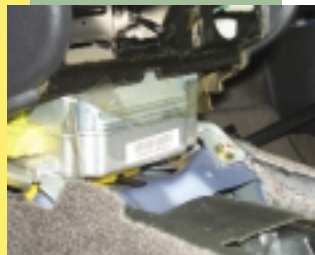
Airbag Control Module