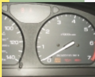
Airbag Warning Light