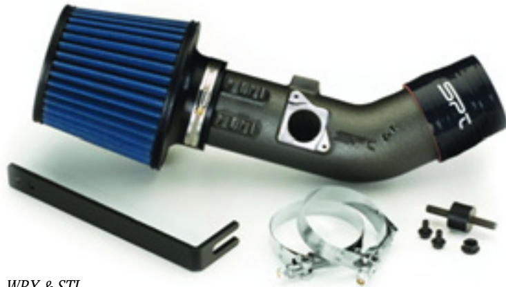
WRX & STI