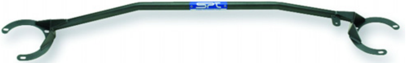
Front Strut Tower Brace

These high-strength aluminum bars increase chassis stability by providing additional stiffness to the front and rear upper suspension area. They are intended for off-road use only.