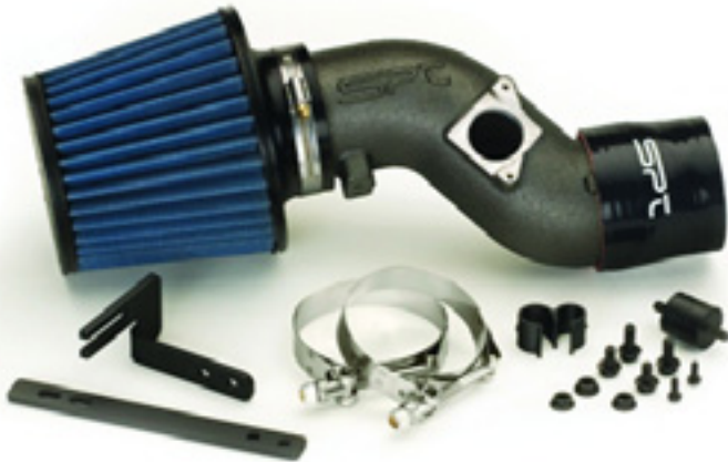
2.5GT & XT

is coated in a new gunmetal gray textured powder-coat finish. Installation of a High Flow Air Intake System will result in increased turbocharger and diverter valve air flow sounds during operation. This condition is indicative of normal operation.