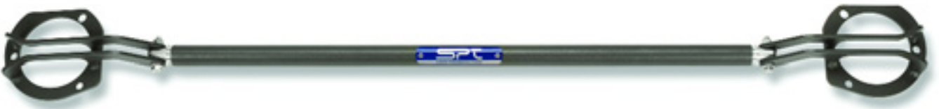
Rear Strut Tower Brace