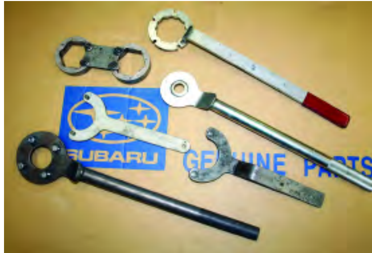
If you're doing engine work, the Subaru Special Service Tools program offers a wide range of holders to do the job right.