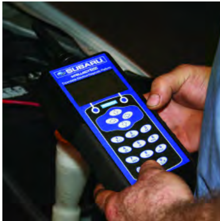
The Subaru inTELLECT EXP-1000 Electrical System Analyzer can prove invaluable for diagnosing electrical system problems.

Complete details regarding the purchase of diagnostic equipment are available on the Subaru Technical Information System website at http://techinfo.subaru.com .