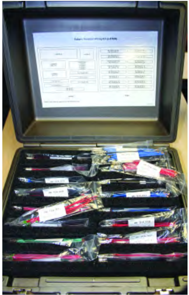
The J-47606 Terminal Wiring Kit supplies all the special wiring and connectors needed for repairing Subaru vehicles.