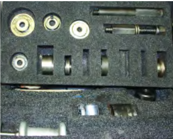
This J-45697 Hub Remover/Replacer Kit is a must for wheel service.