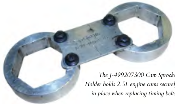
The J-499207300 Cam Sprocket Holder holds 2.5L engine cams securely in place when replacing timing belts.

Subaru of America offers general service and procedure-specific tools to its network of dealers to ensure that Subaru vehicles are properly and correctly serviced. Now, you can use the same Subaru-designed tools in your shop.