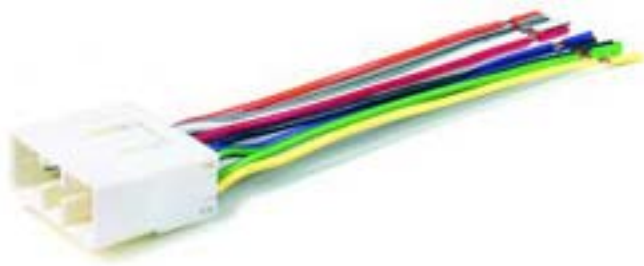
Metra part number 70-8901 for Subaru's