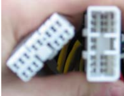
Factory plug on left, OEM adapter plug on right.

Rather than cutting the factory radio harness, simply purchase an adapter from your local mobile audio shop, there only $10-$15.