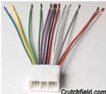
Crutchfield.com Crutchfield part number 120708901 for Subaru's