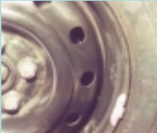
Check for Bent Wheels

Check the tire tread depth. If the tires have uneven wear, it's an indication of an alignment problem (see above) or over/under inflation pressure. The tires must be free of cuts, sidewall damage or abrasions on sidewalls and tread areas. Bulges in the tire sidewalls may indicate belt damage caused by contact with potholes or other obstacles. If the customer has really walloped a pothole, one or more of the wheels may be damaged. If the tires and wheels have passed all of these tests, make sure the tires are inflated to the recommended tire pressure. Don't forget to check the condition of the spare tire. Its tire pressure must be up to specs too.