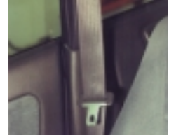
Seat Belt Operation