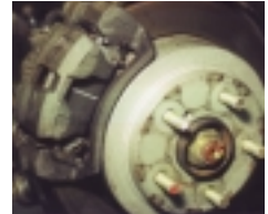
Brake Pad Inspection

Remove the wheels to inspect the condition of the brake linings and shoes. A quick inspection of the brake pads can be performed by looking through the inspection hole in the caliper. For a more comprehensive check, remove the caliper to gain access to the pads. Catching worn brake pads before they have a chance to damage the rotors will save the customer from unnecessary parts replacement expenses. Minimum pad thickness specifications can be found in the Subaru Service Manual.