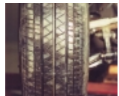
Tire Tread Depth

Did your road test reveal any steering or handling problems? Does the vehicle pull to one side or the other? Look for irregular tire wear that may indicate a wheel alignment problem. Excessive looseness in the steering wheel may signal worn steering system components, such as outer tie rod ends. With the vehicle on a lift, have an assistant turn the steering wheel from side to side while you watch the steering linkage for signs of worn components.