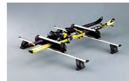
41 Ski attachment (Maximum 4 sets) E361EAG500 For 4 sets of skis or 2 snowboards. *Carrier base required.