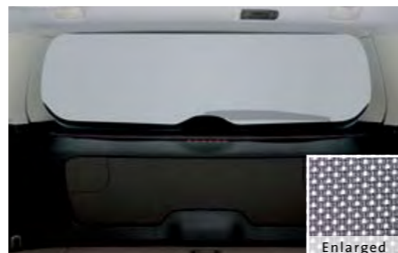
54 Rear sunshade (Rear) F505EAG000 Protects from sunshine and darkens your luggage compartment. Mesh type.