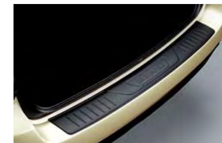
81 Cargo step panel (Outback) E7710AG011 Protects the rear boot lip when loading and unloading.