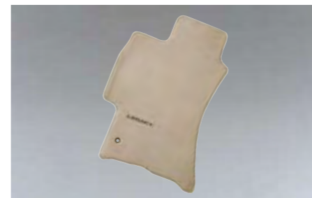
56 Carpet mat Premium Ivory J501EAG301/J501EAG300RH Custom fitted carpet mat with logo. *Front & Rear set.