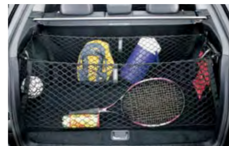
50 Cargo net F551EAG200, F551EAG100, F551EAG300 For a clean and tidy luggage area.