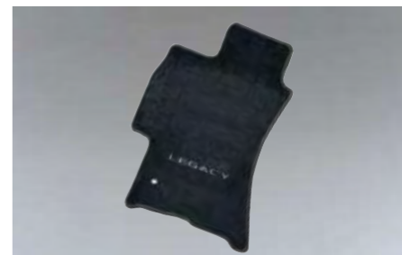
57 Carpet mat Standard J501EAG101/J501EAG100RH Custom fitted carpet mat with logo. *Front & Rear set.