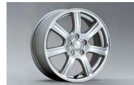
24 Alloy wheel 7-spoke (16 inch) 28111AG000