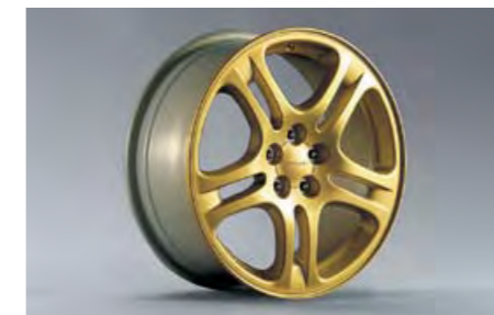
22 Alloy wheel 5-spoke, Gold (17 inch) 28111FE021