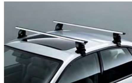
34 Carrier base (Sedan) E361EAG200 Perfectly fitting stylish base for carrier attachments.