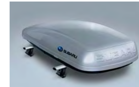
38 Transport box (Short) E361EYA801 Size: 1,792 x 797 x 355 mm. Volume: 380 litres. *Carrier base required.