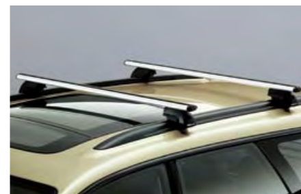
86 Carrier base (Outback) E361EAG100 Perfectly fitting stylish base for carrier attachments.