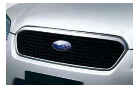
3 Front grille mesh (Black) J1010AG030 Black coloured grid type insert which gives a whole new image to the front. (Made of resin)