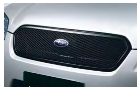
1 Front grille mesh J1010AG010 Mesh type insert which gives a whole new image to the front. (Made of metal)