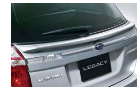
12 Waist spoiler (Wagon) E7210AG020 Primed waist spoiler adds a sporty touch to your vehicle. *Painting required.