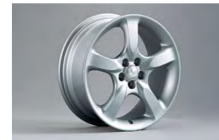
21 Alloy wheel 5-spoke (17 inch) 28111AG010