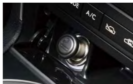
65 Cigarette lighter kit H6010AG100 Change the accessory socket to a cigarette lighter.