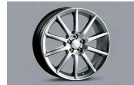
18 Alloy wheel 10-spoke (18 inch) 28111AG090