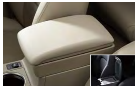
60 Dual console box (Ivory, Black) J2010AG020WA, J2010AG020JC Extra storage within existing centre armrest console. *J2010AG020WA: For Ivory interior. J2010AG020JC: For Off-Black interior.