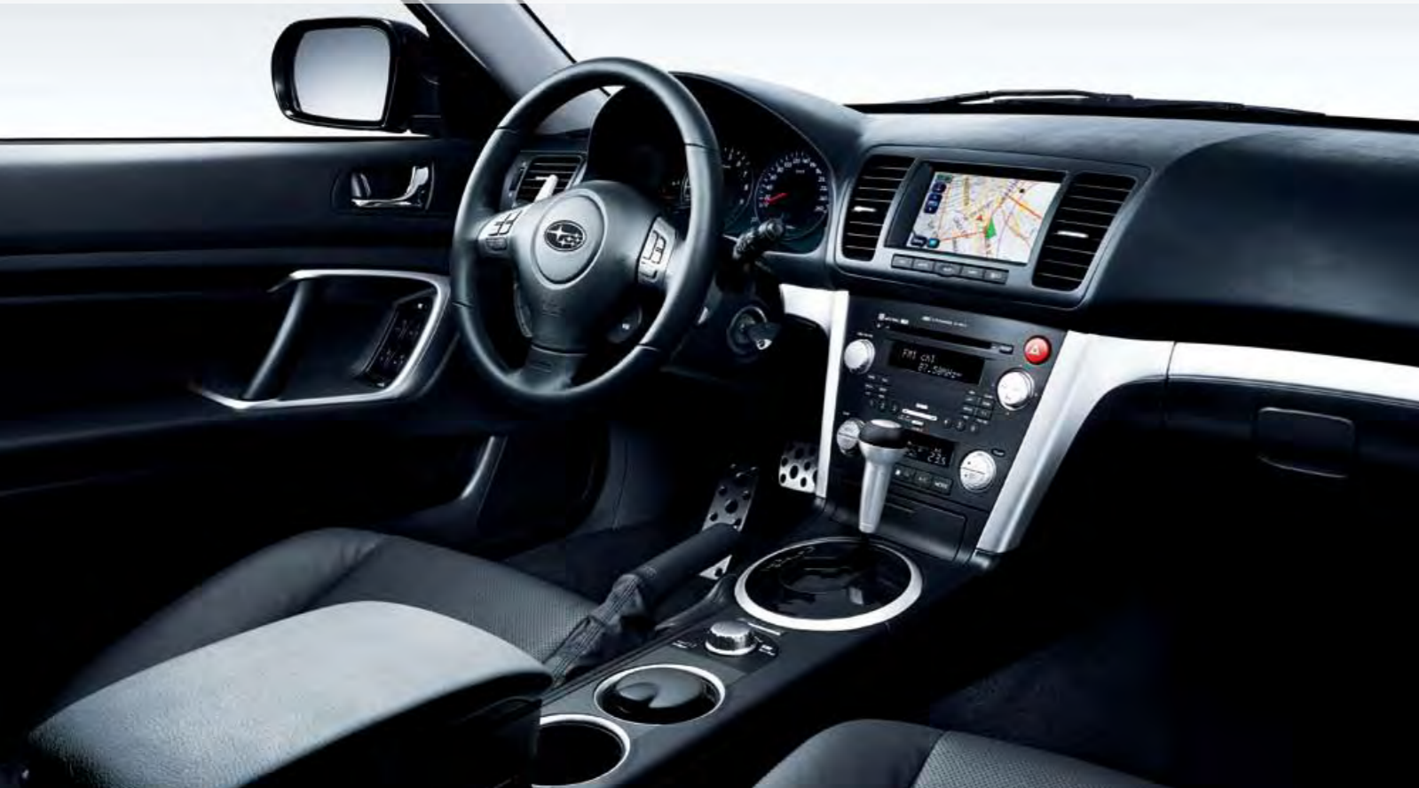
Image: vehicle is presented with Aluminium shift knob, Round type ashtray and Dual console box.