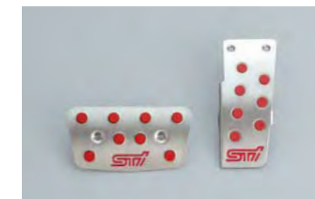
75 STI, Pedal pad set L.H.D. (AT) C8110AG010, C8110SA010 Sporty looking set of pedals made of aluminium. *Except for the models with factory installed aluminium pedals.