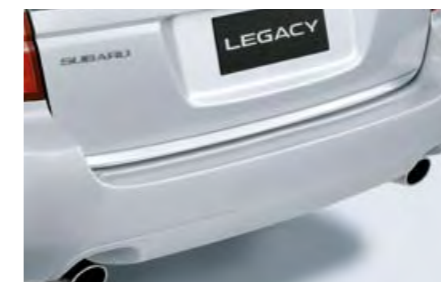
30 Rear gate end moulding (Wagon) E751EAG000 Stylish chrome finished moulding.