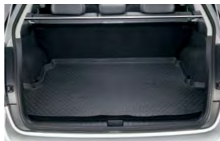
48 Cargo tray (Sedan, Wagon) J511EAG010, J511EAG000 Protects cargo area floor from dust and dirt.