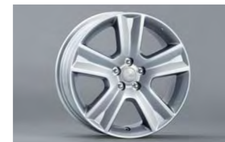
84 Alloy wheel 5-spoke (17 inch) 28111AG130