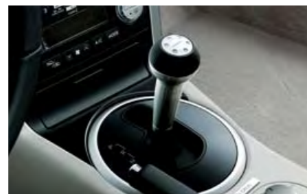
67 Aluminium shift knob (AT) C101ESA002 Stylish aluminium shift knob with Subaru logo.