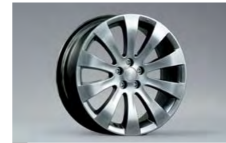
17 Alloy wheel 10-spoke (18 inch) 28111AG261