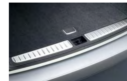
32 Cargo room plate (Wagon) 95073AG010JC Protects the rear boot lip when loading and unloading.