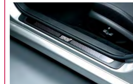
76 STI, Side sill plate E1010AG010 Replaces existing sill plates with a more sporty look. *Front & Rear set.