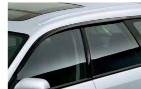
5 Side visor (Wagon) E3610AG010 Allows windows to stay open for ventilation during unsettled weather.