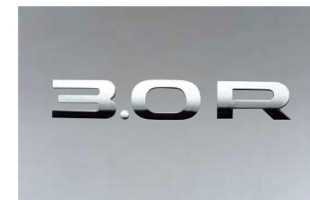
15 Grade emblem 3.0R J1210AG224, J1210AG204 Adds an accent to rear styling. *J1210AG204: For vehicles without Subaru letter mark.