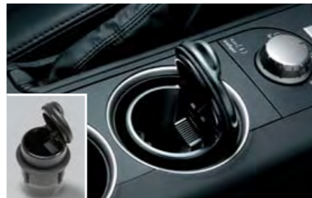
64 Round type ashtray F6010AG000 Cup type ashtray exactly fits the centre cup holder.