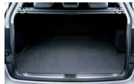
47 Cargo mat J515EAG000 Protects cargo area. Carpet with air cleaning function.