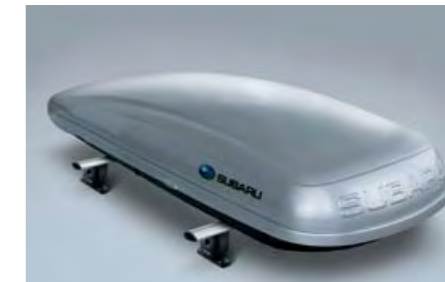
37 Transport box (Long) E361EYA900 Size: 2,267 x 805 x 355 mm. Volume: 430 litres. *Carrier base required.