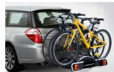
45 Rear bicycle holder (Installed on tow ball) E365EFG800/E365EFG900 Transports 3 bikes on tow ball. *Trailer hitch needed.