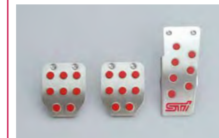
74 STI, Pedal pad set L.H.D. (MT) C8110AG000, C8110SA000 Sporty looking set of pedals made of aluminium. *Except for the models with factory installed aluminium pedals.

FHI and STI have collaborated in order to create a concept of “total tuning” to emphasise the performance of the original vehicle.