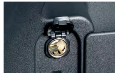
63 Cargo socket kit H6710AG000 Convenient 12-volt power outlet for outdoor activities etc.

Image: vehicle is presented with Cargo net, Cargo tray, Cargo room plate and Cargo step panel