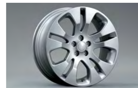
83 Alloy wheel, Lustrous silver (17 inch) 28111AG250