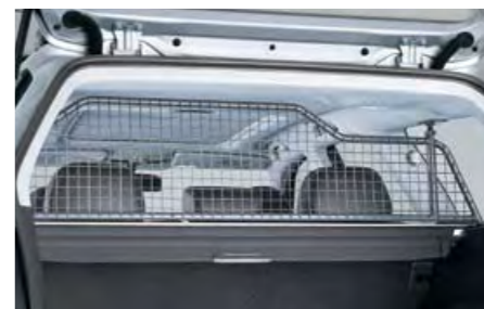
51 Dog guard (G/M) F551EAG011 Separates cargo room from passenger area, applicable for ISOFIX child seat.