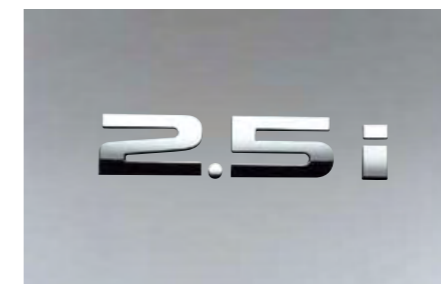
14 Grade emblem 2.5i J1210AG225, J1210AG205 Adds an accent to rear styling. *J1210AG205: For vehicles without Subaru letter mark.