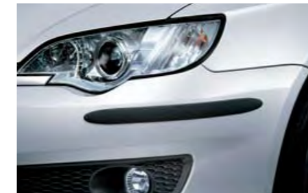
26 Bumper corner protector (Front & Rear set) J1010LE100 Protects bumper corners.