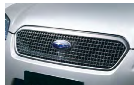
2 Front grille mesh J1010AG020 Grid type insert which gives a whole new image to the front. (Made of resin)