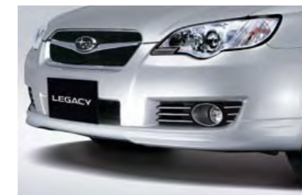
7 Front under spoiler (3.0R) E2410AG020 Gives an aggressive performance look. *Painting required.