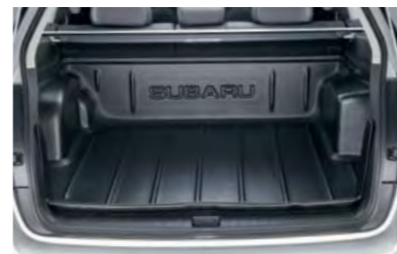
49 Deep cargo tray J511EAG100 Extra protection for the load area. Suitable for fishing and hunting.