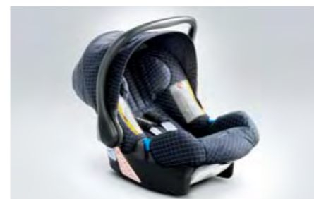
71 Child seat SUBARU Baby safe plus F410EYA102 Includes sun canopy. *Complies with Euro NCAP.