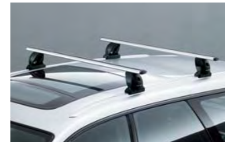
35 Carrier base (Wagon) E361EAG000 Perfectly fitting stylish base for carrier attachments.