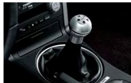
66 Aluminium shift knob (MT) C105EFE000 Stylish aluminium shift knob with Subaru logo.