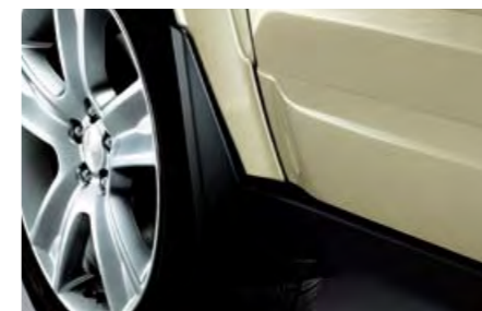
79 Splash guard (Front set/Outback) J1010AG241 Helps protect your vehicle from mud and snow. *Black colour.