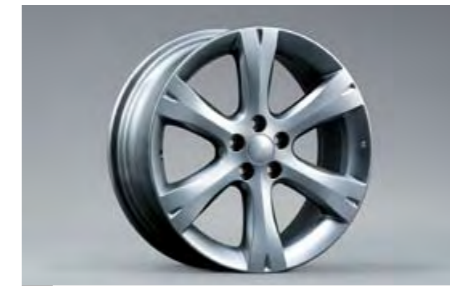
19 Alloy wheel 6-spoke, Lustrous silver (17 inch) 28111AG270