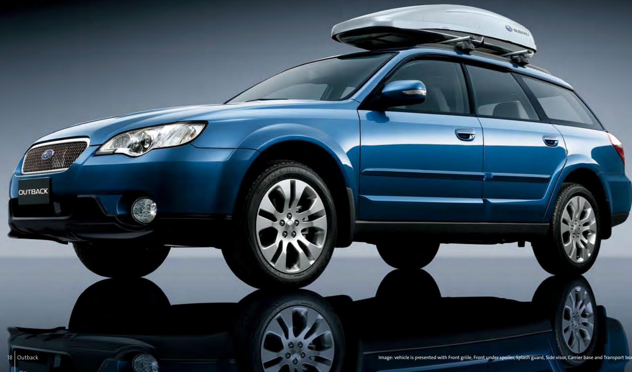
Image: vehicle is presented with Front grille, Front under spoiler, Splash guard, Side visor, Carrier base and Transport box (Long).