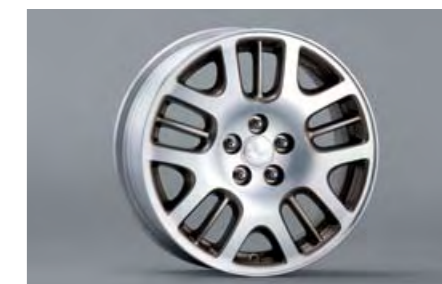
85 Alloy wheel 10-spoke (16 inch) 28111AE120