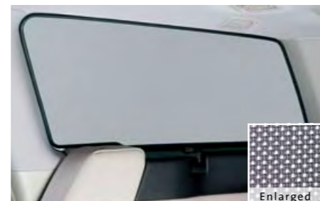
53 Rear sunshade (Side) F505EAG100 Protects from sunshine and darkens your luggage compartment. Mesh type.