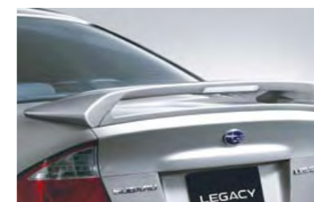
10 Trunk lid spoiler (Large) E7210AG000## Primed rear spoiler adds a sporty touch to your vehicle.