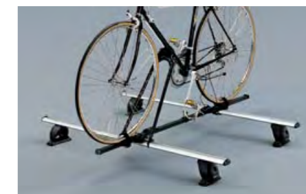
42 Bicycle holder (Basic) E361ESA701 Fits perfectly on the carrier base. *Carrier base required.