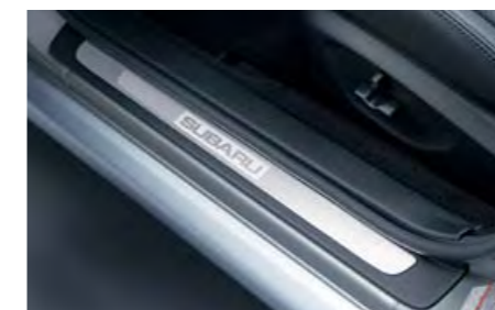
33 Side sill plate E1010AG000 Replaces existing sill plates with a more sporty look.