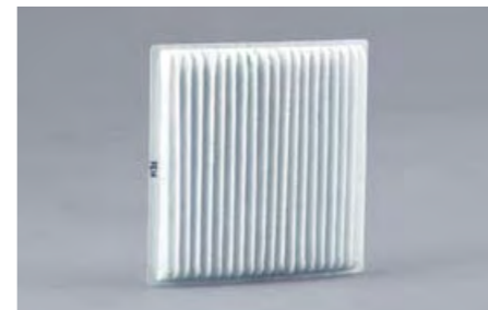
62 Anti dust filter 72880AG000 Helps reduce dust and pollen infiltration into the vehicle cabin area. For the best result, it is recommended to replace the filter once a year or every 12,000 km. *For the replacement of originally equipped filter.