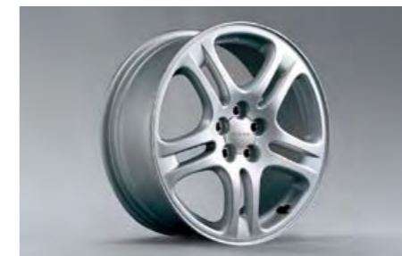
23 Alloy wheel 5-spoke, Silver (17 inch) 28111AE019