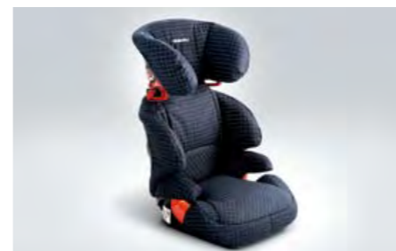
73 Child seat SUBARU KID plus F410EYA212 Extra protection in case of side impact. *Complies with Euro NCAP.