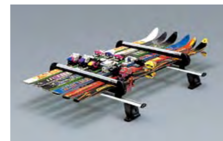
40 Ski attachment (Maximum 6 sets) E361EAG550 For 6 sets of skis or 4 snowboards. Usable width: 640 mm. *Carrier base required.