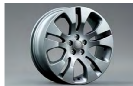
82 Alloy wheel, Grey (17 inch) 28111AG280