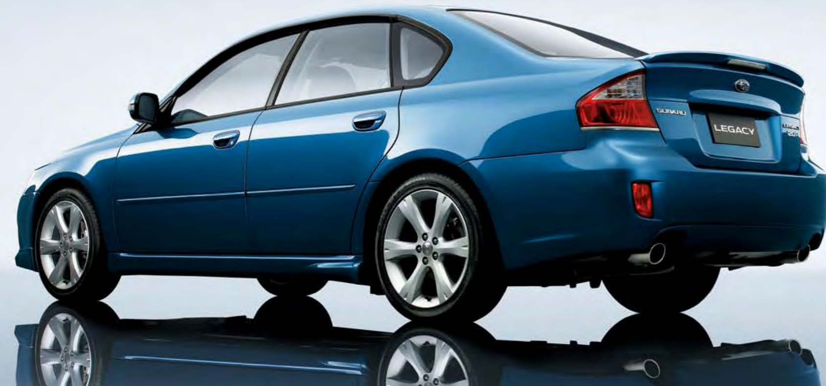
Image: vehicle is presented with Front under spoiler, Side strake, Trunk lid spoiler (Small), Side visor and Grade emblem