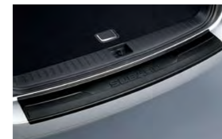
31 Cargo step panel (Wagon) E771EAG000 Rugged plastic resin cover helps protect upper surface of rear bumper.