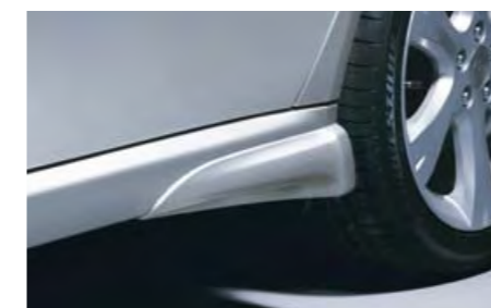
9 Side strake E2610AG050 Gives an aggressive performance look. *Painting required.