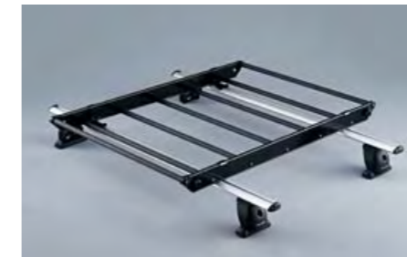
36 Roof rack platform E361EAG700 Enhances your load carrying drastically. *Carrier base required.