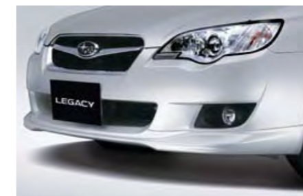
6 Front under spoiler (2.0R, 2.5i, 2.5GT) E2410AG000 Gives an aggressive performance look. *Painting required.