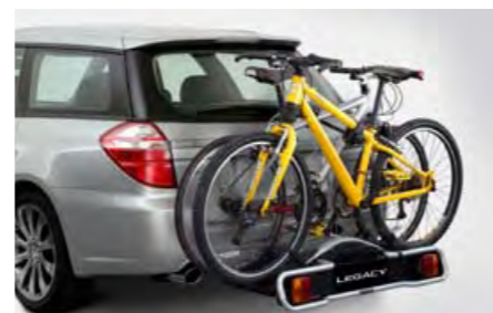
44 Rear bicycle holder (Installed on tow ball) E365EFG600/E365EFG700 Transports 2 bikes on tow ball. *Trailer hitch needed.