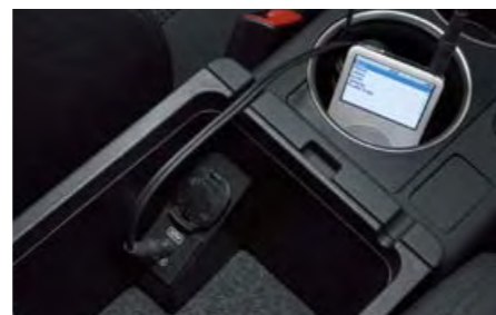
68 AUX mini jack H6210AG000 A 3.5 mm auxiliary stereo mini-pin jack socket that allows you to listen to the sounds from portable music players. Now you can enjoy your own music through the car speakers.