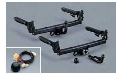
46 Trailer hitch (Fixed, Detachable) See application list (page 16) Maximum towing capacity 2,000 kg.

Image: vehicle is presented with Front grille, Front under spoiler, Carrier base and Transport box (Long)