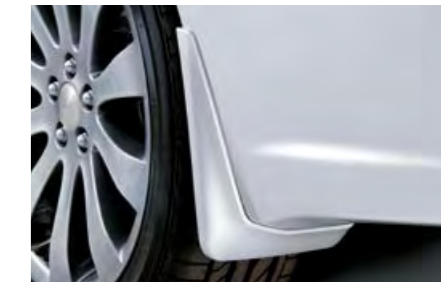
28 Splash guard (Rear set/Sedan, Wagon) J1010AG264, J1010AG224 Helps protect your vehicle from mud and snow.