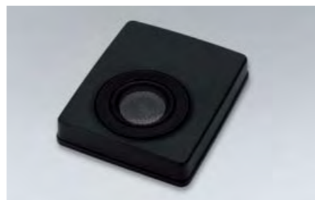
69 Subwoofer H630SAG000 Adds 120 watts of power, and delivers super bass sound you not only hear but feel. *Not compatible with Macintosh audio. AV tray is needed for installation under right side seat.