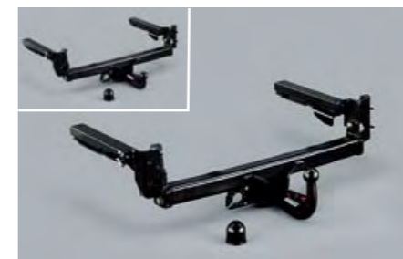
87 Trailer hitch (Outback) L101EAG061/L101EAG071/L101EAG070 Maximum towing capacity 2,000 kg.