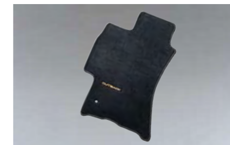
88 Carpet mat Outback Premium Black J501EAG211/J501EAG210RH Custom fitted carpet mat with logo. *Front & Rear set.