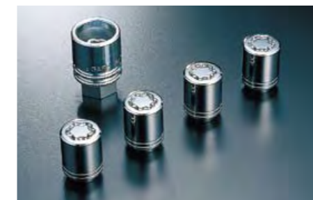
25 Wheel lock nut B327EYA000