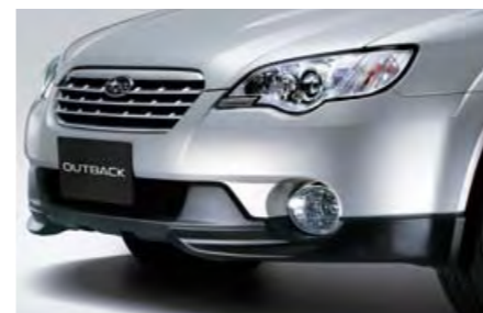
78 Front under spoiler (Outback) E2410AG030/E2410AG030MD Gives an aggressive performance look. *E2410AG030MD: For two-tone colour vehicle.