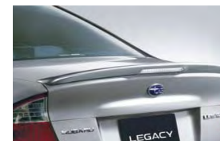
11 Trunk lid spoiler (Small) E7210AG010 Primed rear spoiler adds a sporty touch to your vehicle. *Painting required.