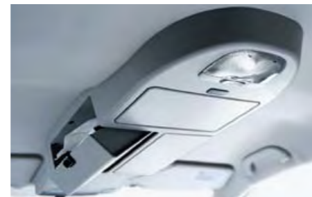
59 Over head console J2010AG100 This ceiling compartment is equipped with a room lamp. *For no sunroof vehicle.