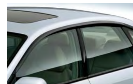
4 Side visor (Sedan) E3610AG000 Allows windows to stay open for ventilation during unsettled weather.