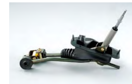
77 STI, Short gear shift lever (5MT, 6MT) C1010AG000, C1010AG100 Quick gear change and a more rigid & direct shift feeling. (Photo: 5MT) *Except for Dual-range transmission vehicle.