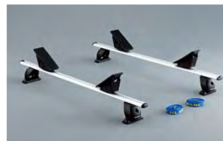
39 Kayak attachment E361EAG600 For 1 kayak. *Carrier base required.