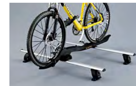
43 Bicycle holder (Barracuda) E361ESA501 Bike holder with aerodynamic design, easy bike installation. *Carrier base required.