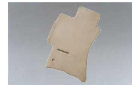
89 Carpet mat Outback Premium Ivory J501EAG311/J501EAG310RH Custom fitted carpet mat with logo. *Front & Rear set.