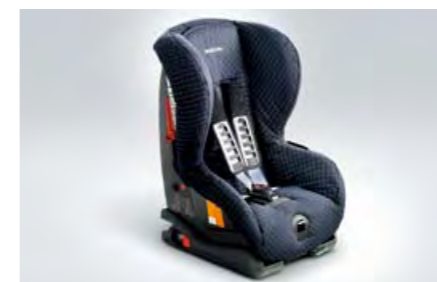
72 Child seat SUBARU Duo plus F410EYA002 Secure installation by ISOFIX. *Complies with Euro NCAP.