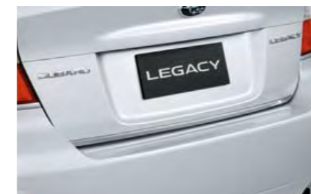
29 Rear gate end moulding (Sedan) E755EAG100 Stylish chrome finished moulding.