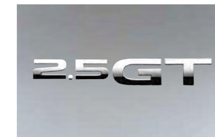
16 Grade emblem 2.5GT J1210AG227 Adds an accent to rear styling.