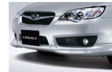
8 Front under spoiler (2.5GTB, 3.0RB) E2410AG010 Gives an aggressive performance look. *Painting required.