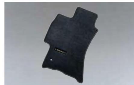
55 Carpet mat Premium Black J501EAG201/J501EAG200RH Custom fitted carpet mat with logo. *Front & Rear set.