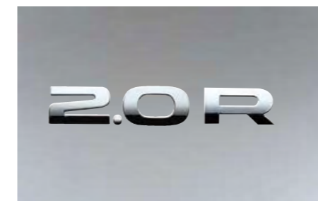
13 Grade emblem 2.0R J1210AG221, J1210AG201 Adds an accent to rear styling. *J1210AG201: For vehicles without Subaru letter mark.