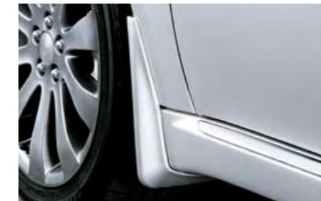
27 Splash guard (Front set) J1010AG221 Helps protect your vehicle from mud and snow.