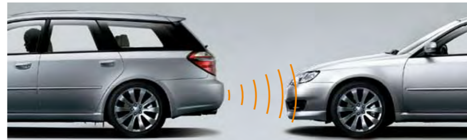
70 Acoustic parking aid H481ESA002 Great help for easy parking. No drilling of the bumper required.