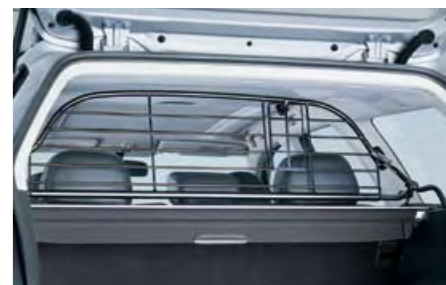
52 Dog guard (K/M) F551EAG000 Separates cargo room from passenger area, applicable for ISOFIX child seat.