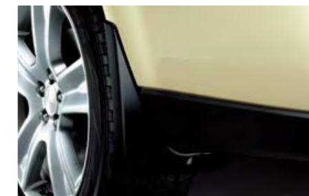
80 Splash guard (Rear set/Outback) J1010AG244 Helps protect your vehicle from mud and snow. *Black colour.